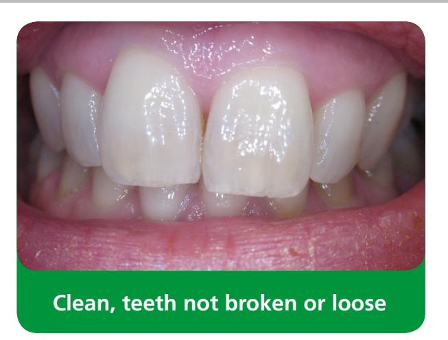
Teeth & Gums